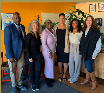
APHA Minneapolis, MN 2024