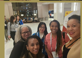
APHA Minneapolis, MN 2024