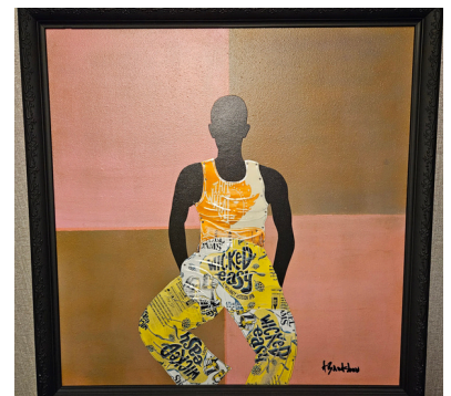
Entitled, Wide-leg Jeans, using Samuel Adams cans (Boston)