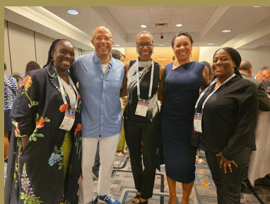
National Medical Association NYC August 2024