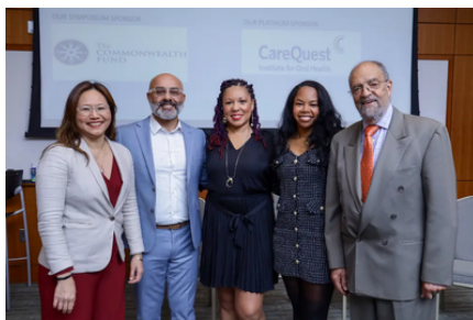
Reede Scholars at the Annual Meeting May 2024